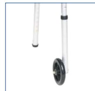
Rear Glide Caps Standard On Walker With Wheels

ProBasics Two-Button Release Folding Walkers provide maximum strength in a lightweight aluminum design, all backed by a limited lifetime warranty. Ample height adjustment options coupled with a two-button folding mechanism make ProBasics Folding Walkers easy to use and accommodating to the most demanding patient needs. Available with or without 5" wheels and in junior or adult sizes. Supports patient weights up to 300 pounds.